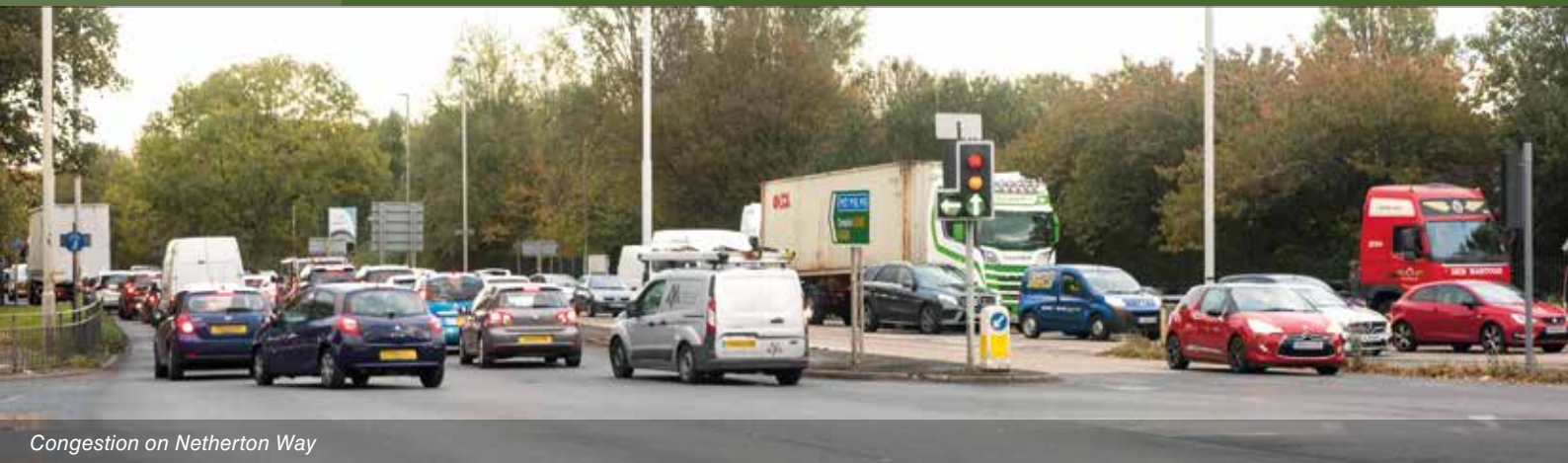
Congestion on Netherton Way

W elcome to another edition of our newsletter, keeping you updated on our proposals to improve the A5036 between Switch Island and Princess Way. Our aim is to reduce congestion and make journeys quicker and safer for residents, communities, commuters – for everybody.